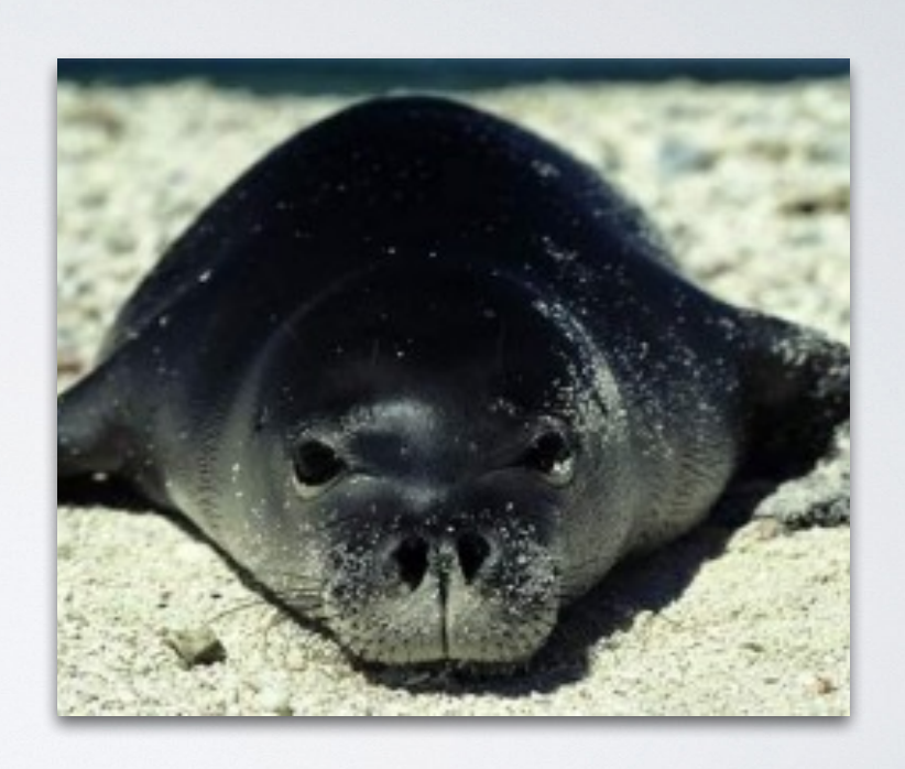
Caribbean Monk Seal