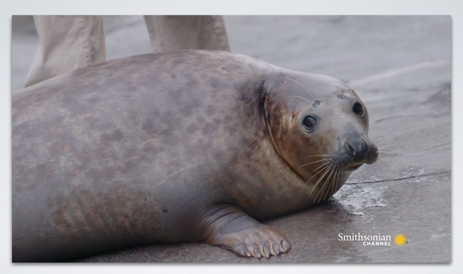
Sea Lions vs. Seals