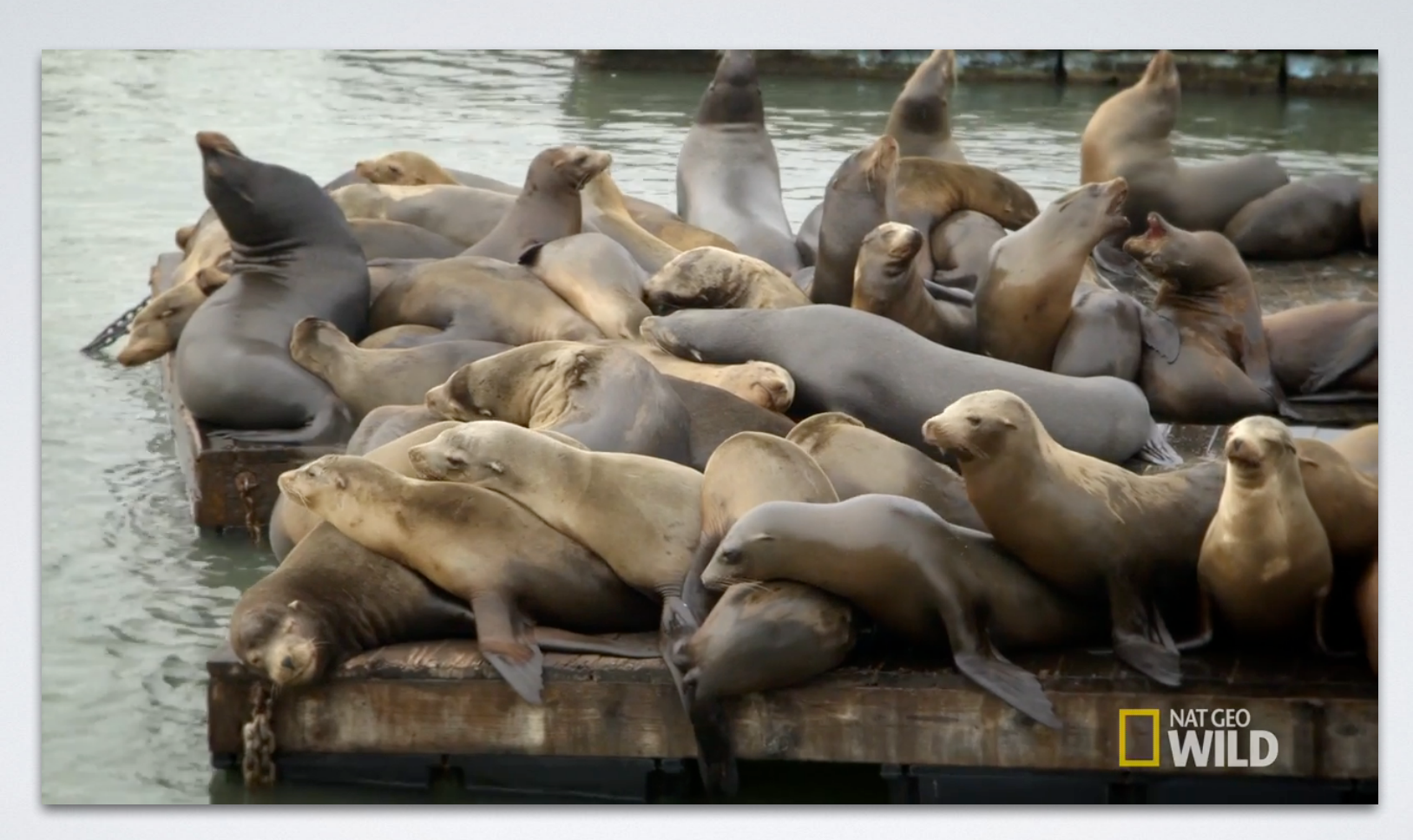
San Francisco Sea Lion