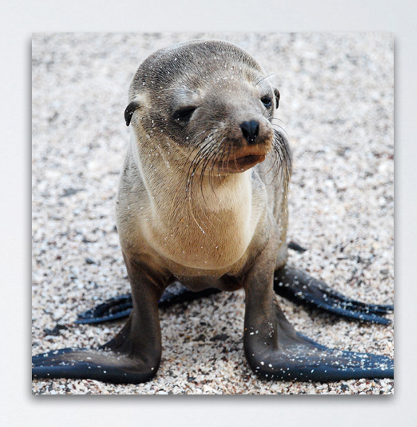
Galapagos Sea Lion