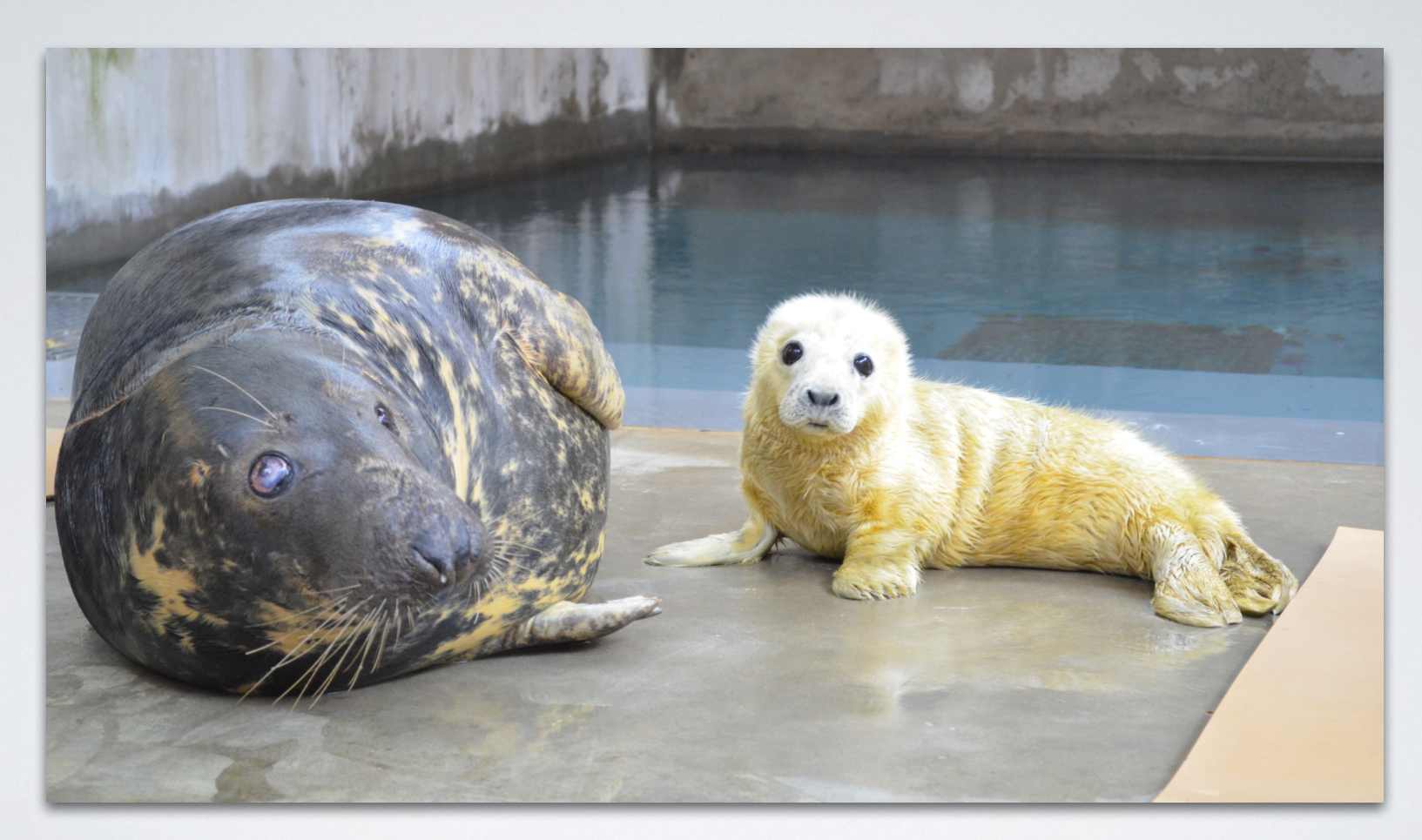
Mom and Pup Seal at Smithsonian's National Zoo