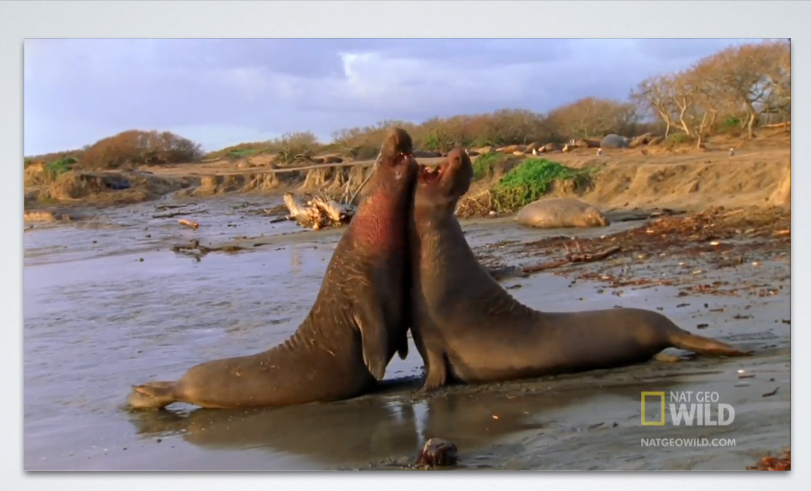
Elephant Seal Battle [graphic]