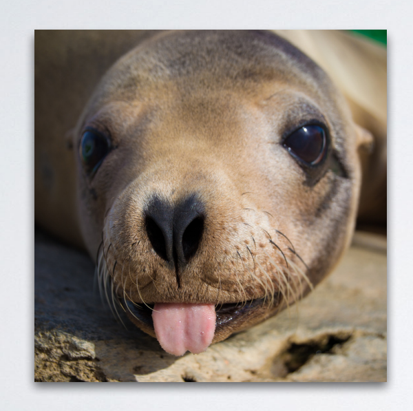
California Sea Lion