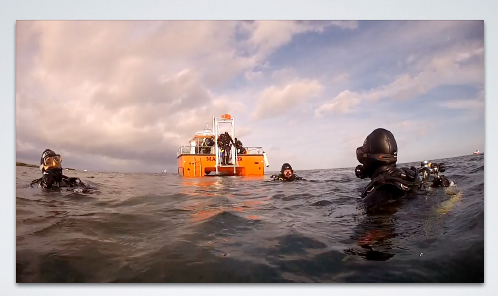
Seal on the Move