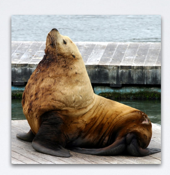
Steller Sea Lion